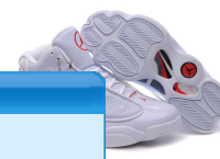
Air Jordan 12 Jordan 11 fusion white black red ID:6072 Free Shipping